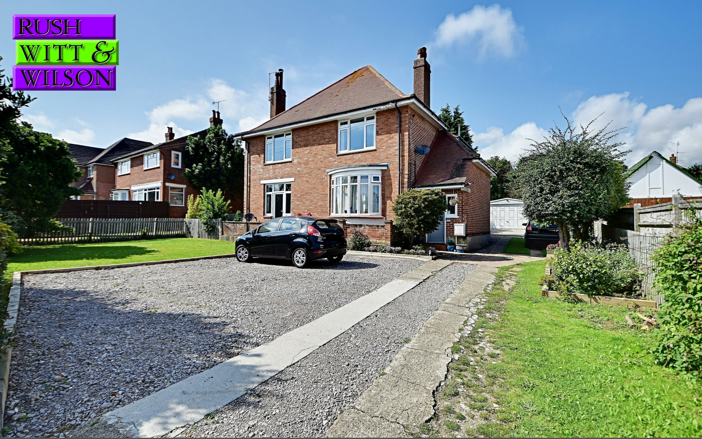
Flat 2, 121 De La Warr Road, Bexhill-On-Sea, East Sussex TN40 2JN £280,000