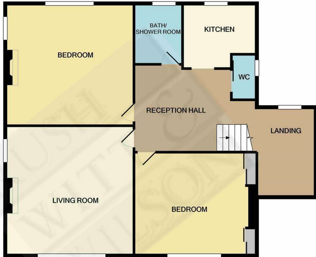
1ST FLOOR APPROX. FLOOR AREA 1048 SQ.FT. (97.4 SQ.M.)

TOTAL APPROX. FLOOR AREA 1182 SQ.FT. (109.8 SQ.M.)